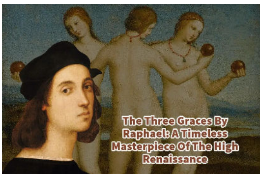
The Three Graces By Raphael: A Timeless Masterpiece Of The High Renaissance