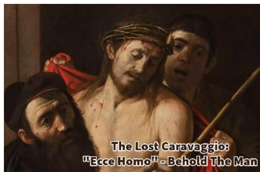
The Lost Caravaggio: "Ecce Homo" - Behold The Man